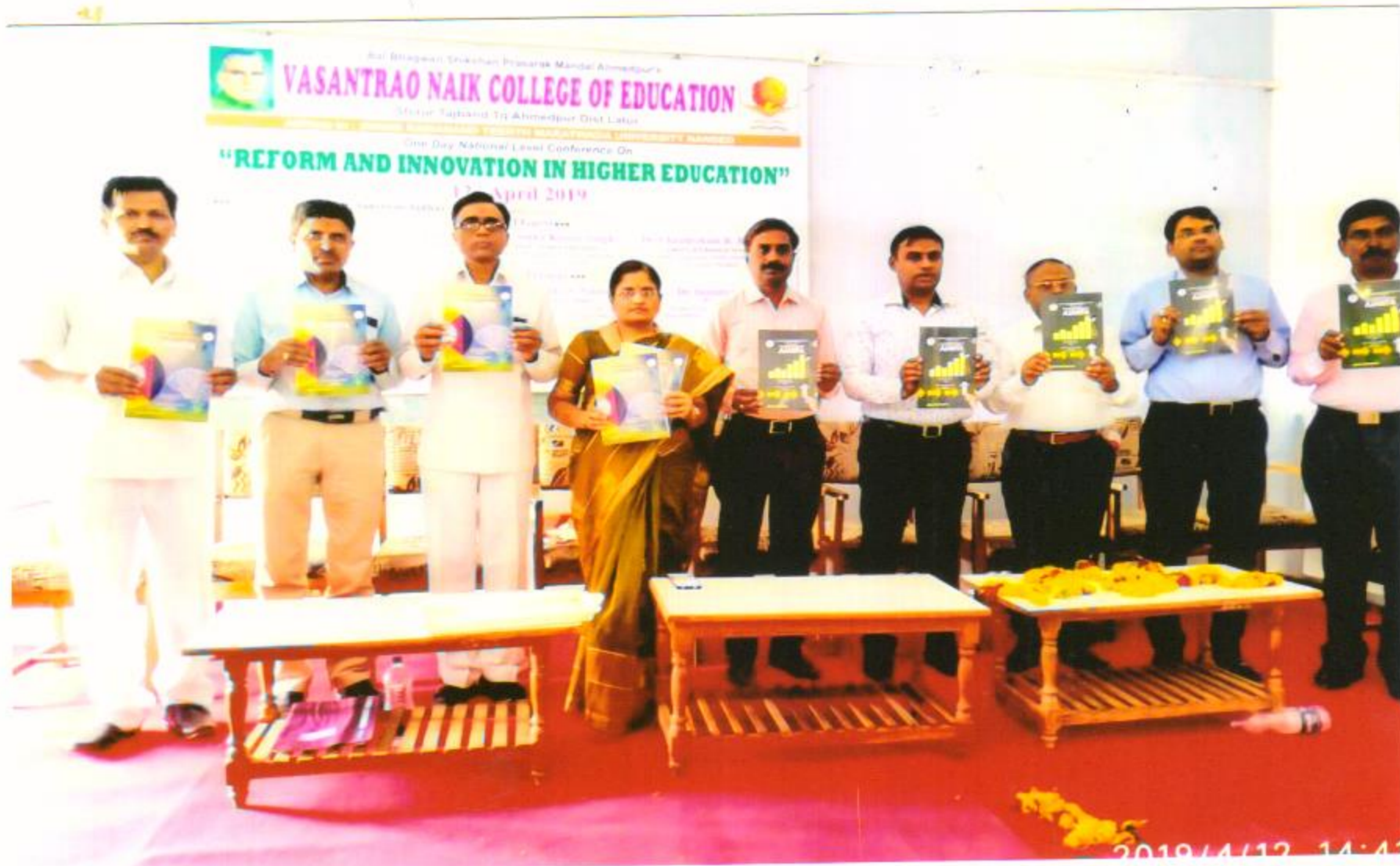
National Conference Date : 12/04/2019