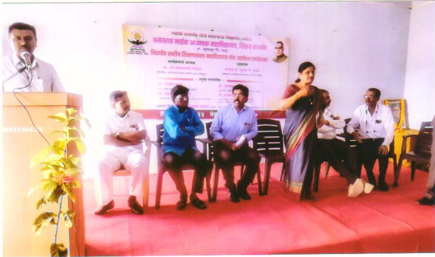
NAAC Workshop Date : 29/04/2023